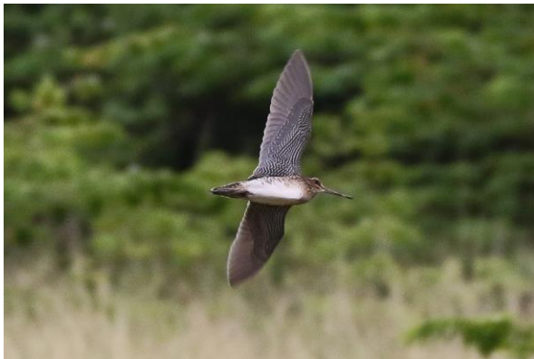
Swinhoe's Snipe (R.Baxter)

they both crashed into the nearby marsh. The following day we drove past the wetlands and the Yellow Bittern flew from the same spot we had last seen it the day before. It had somehow survived.