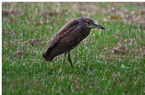
Black-crowned Night Heron (Damian Baxter)

During the day we had further views of the thrush, located another Blue & White Flycatcher and once again had views of the Chinese Sparrowhawk soaring over the mansion grounds. Mike Carter went for a stroll along the lagoon edge and found a Javan Pond Heron which we were unable to relocate.