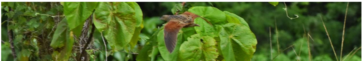
Corncrake (Robert Shore)

With the final mega rarity of the trip in the bag we only had one morning left on Christmas Island. We returned to the area of open grassland where we had previously found the Corncrake and this time we were rewarded with a nice surprise in the form of two JAPANESE SPARROWHAWK which circled overhead.