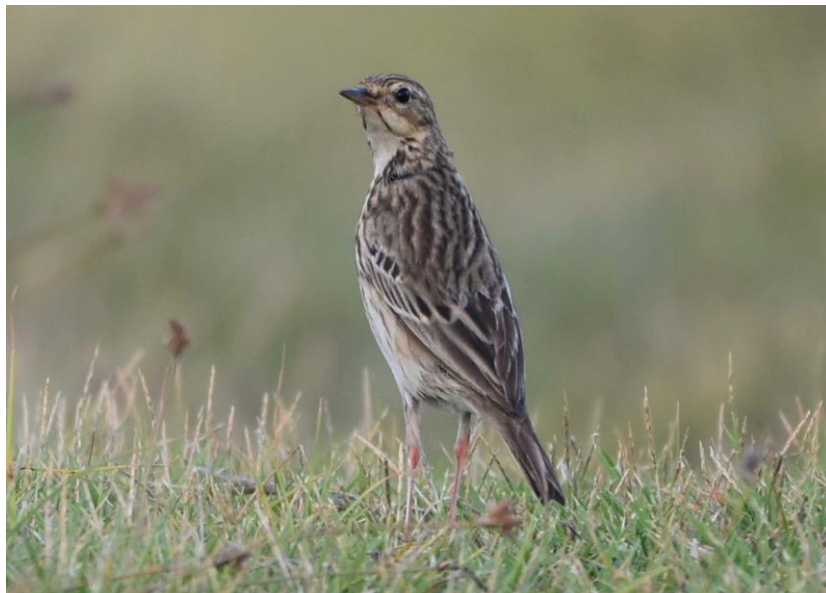
Tree Pipit (Rob Shore)

After enjoying our time with this spectacular species, we returned for breakfast, looked at our photos and well pleased with our morning's sighting we headed off for another attempt at the pintail. We did finally manage to come up trumps with great views of NORTHERN PINTAIL followed by a quick trip to Home Island which produced three Chinese Sparrowhawks simultaneously circling overhead.