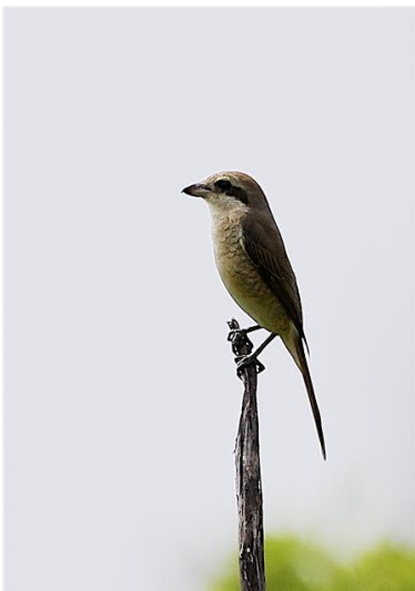
Brown Shrike (Jenny Spry)

The following day was one of the best of the trip with an early morning viewing of BROWN SHRIKE , which was a new OZ bird for everyone on the trip and one I had personally long waited to see. They were indeed soul satisfying views. Later that morning we found a Schrenck's Bittern standing on the roadside verge near the rubbish tip. This was one of those incredible Cocos birding events where tired birds that have just arrived on the island stand on the grass roadside verge and allow nice views.