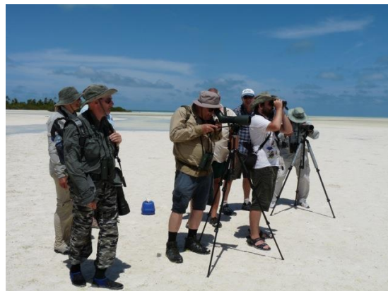
South Island (David Koffel)