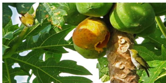
Christmas Island White-eye (R.Baxter)