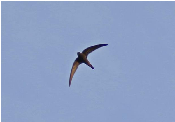
Common Swift (R.Baxter)

This astonishing transcontinental crippler winters exclusively in Equatorial and Sub-Equatorial Africa, making it one of the finest birds we've ever found on these tours and surprisingly yet another Western Palearctic migrant.