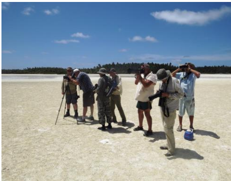
Searching for Saunders's (James Mustafa)

Day six was our trip to South Island where we located 15 SAUNDERS'S TERN and a EURASIAN CURLEW . Great views of the terns were complimented by some tasty lunch, before we made our way into the water for an enjoyable swim. We finished the day at the local restaurant on West Island.