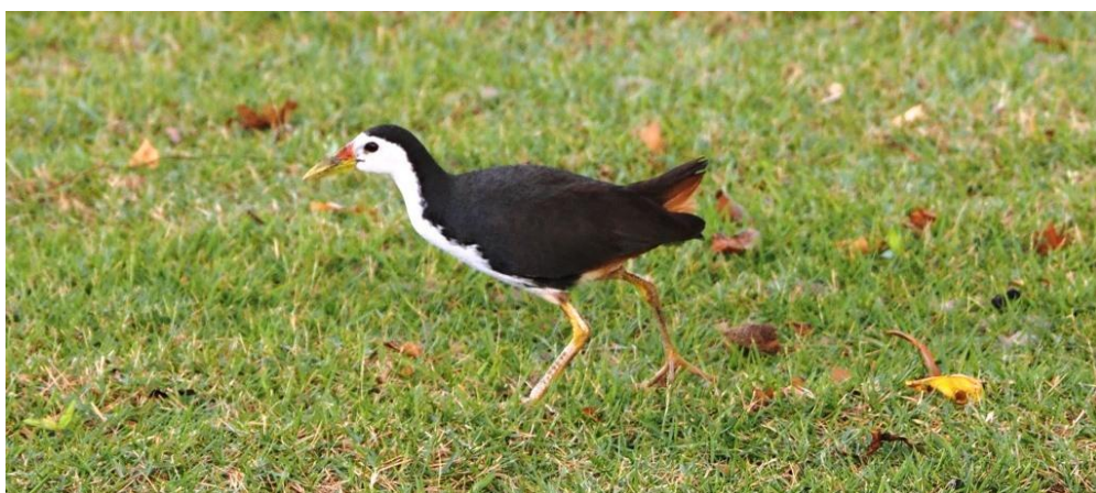
White-breasted Waterhen (Warwick Remington)

Over the next couple of days we ventured further into the local rainforest, which in my opinion, is close to the best Australia has. Several Common Emerald Dove and a few White-breasted Waterhen were seen during our drives, as were White-throated Needletails and Common Noddy .