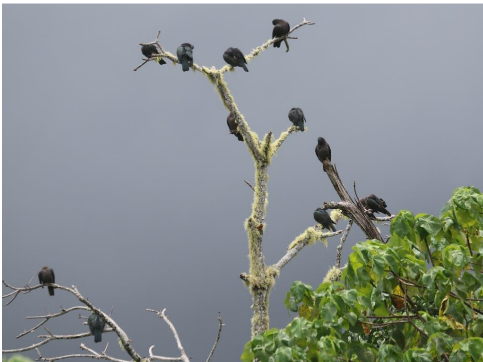
Christmas Island Imperial Pigeon (Richard Baxter)

We finished dropping our luggage off at our motel and grabbed a quick lunch before commencing a bit of local birding. A few people in the group had been on my tour before and they headed off to check a couple of local hotspots while I began the search for the local endemics with the rest of the group. Before long we had seen Island Thrush , Glossy Swiftlet , Brown (CI) Goshawk , Christmas Island White-eye and a tree full of Christmas Island Imperial Pigeon , as the sky blackened ahead of an afternoon tropical downpour.