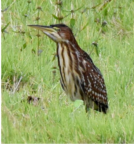
Schrenck's on the road side