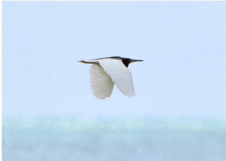
The long staying Chinese Pond Heron (Robert Shore)

Day six was our trip to South Island where we located 15 SAUNDERS'S TERN and a EURASIAN CURLEW . Great views of the terns were complimented by some tasty lunch, before we made our way into the water for an enjoyable swim. We finished the day at the local restaurant on West Island.