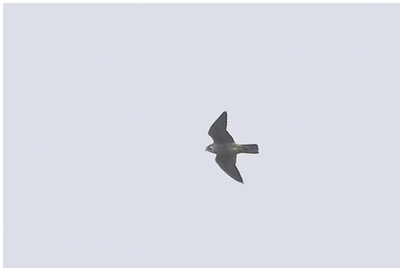
Peregrine Falcon (Jenny Spry)

Later that afternoon a few of our group managed to locate a Peregrine Falcon soaring along one of the island's ridge lines. This bird was a small male of one of the rare migratory races of peregrine, either japonensis or calidus which travel down from the Arctic leapfrogging other peregrine ssp along the way. This sighting wrapped up yet another splendid day and our final full day on the island prior to our departure to Cocos.