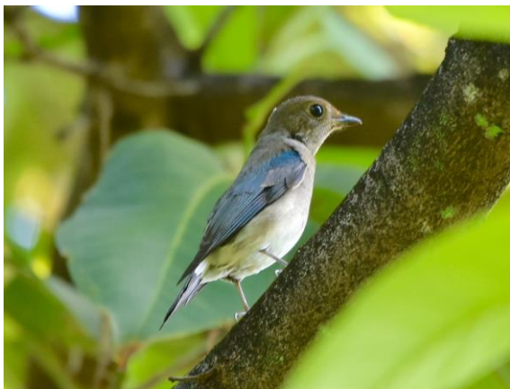
Blue & White Flycatcher (Robert Shore)

What followed next was without doubt the biggest dip of the tour. Those of us that had seen Blue & white Fly previously focused our efforts on the other yellow/orange bird. It stayed deeper in the thick canopy and although several of us had obtained enough glimpses to say it was a Yellow-rumped/Narcissus type Flycatcher, it quickly evaporated into thin air, never to be identified and to remain as a slashbird. We were certainly not disappointed as we continued our run of great sightings, with the best still yet to come.