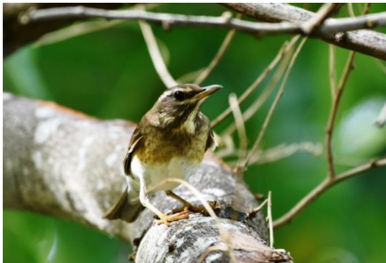
Eye-browed Thrush (Rob Shore )