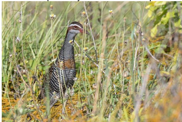
Buff-banded Rail race andrewsi

Our highly successful trip was coming to an end. We only had one and a half days remaining but that time would still provide yet another two exquisite and rare vagrants.