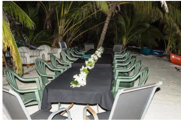
Cocos Sunset and our final night beach dinner (Jill Harvey)