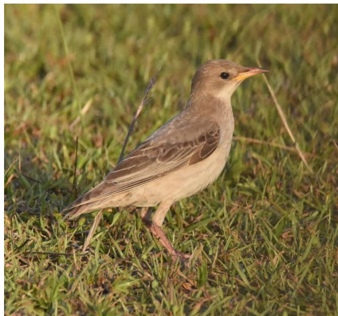
Rosy Starling