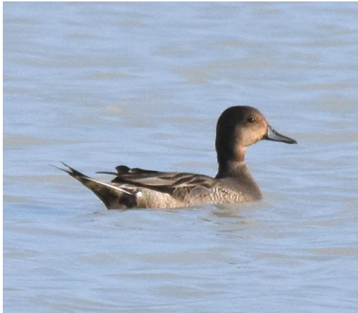
Northern Pintail (G.Christie)

The West Island wetlands have continued to surprise us for over a decade and every time we venture in, there is the hope of a new vagrant, particularly during migration time. With this in mind we visited the wetlands every day. The next day was to prove one of those days. We all sat scanning with scopes and binos, when a smaller duck was spotted loafing on the far shore amongst the Pacific Black Duck. After a while it moved out into the water showing its long pointed tail and revealing itself as a NORTHERN PINTAIL .