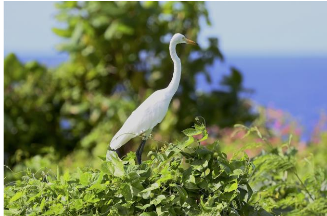
Intermediate Egret (Jenny Spry)

The following day was one of the best of the trip with an early morning viewing of BROWN SHRIKE , which was a new OZ bird for everyone on the trip and one I had personally long waited to see. They were indeed soul satisfying views. Later that morning we found a Schrenck's Bittern standing on the roadside verge near the rubbish tip. This was one of those incredible Cocos birding events where tired birds that have just arrived on the island stand on the grass roadside verge and allow nice views.