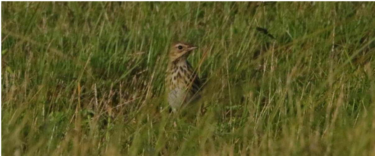
Tree Pipit (Richard Baxter)

We were birding the southern end of the runway early morning and Robert Shore decided to catch the ferry to Home Island to do some photography. Damian and Rob set off for the jetty and a couple of minutes later came rushing back, having just found a pipit at the northern end of the runway. We all soon located the confiding bird, which happily stayed on the grass track, where for the next hour we were all treated to superb views of this astounding mouth-watering mega. This individual permitted us to approach to within only a few metres allowing amazing photographic opportunities. Incredible birding indeed!