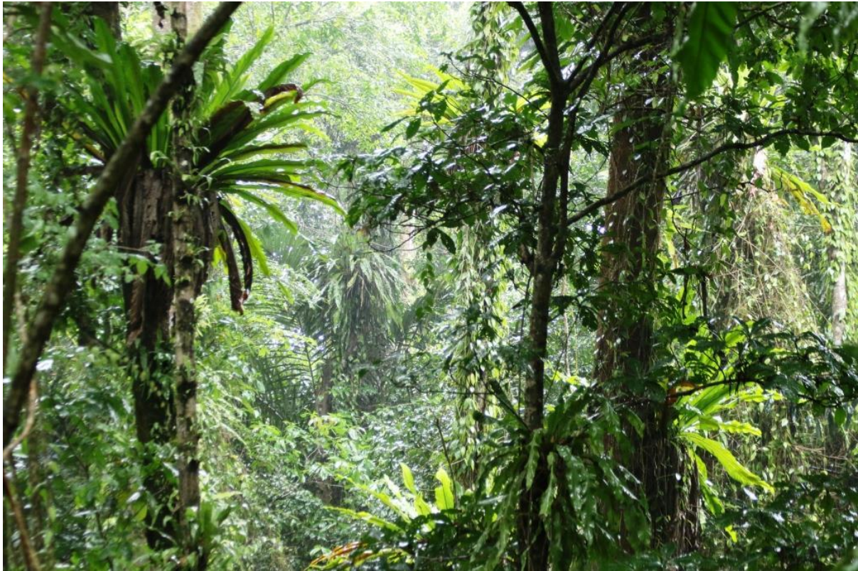
Christmas Island rainforest (R.Baxter)