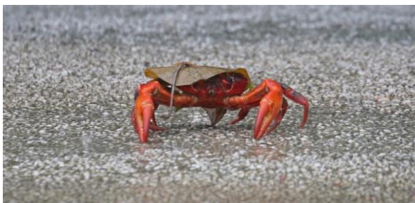
Red Crab with leaf umbrella (R.Baxter)

We also had two nights on the island's plateau where the entire group saw GREY NIGHTJAR and another night with close encounters with the local Christmas Boobook .