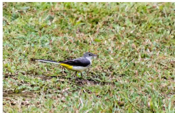
Grey Wagtail (Karen Donkin)

The week was drawing to an end but we still had a few of the migrant hotspots to visit in the hope of adding new species to our ever growing list and after breakfast we headed off with an action-packed day ahead of us.