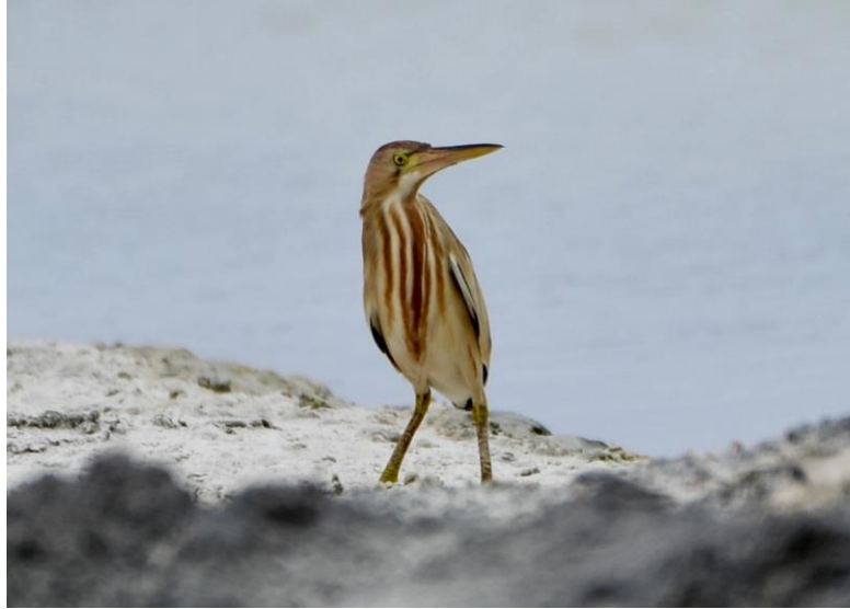
Yellow Bittern