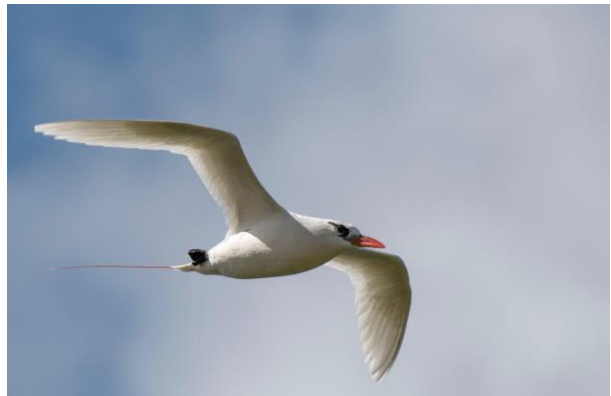
Red-tailed Tropicbird (Bob Harvey)

Later that afternoon a few of our group managed to locate a Peregrine Falcon soaring along one of the island's ridge lines. This bird was a small male of one of the rare migratory races of peregrine, either japonensis or calidus which travel down from the Arctic leapfrogging other peregrine ssp along the way. This sighting wrapped up yet another splendid day and our final full day on the island prior to our departure to Cocos.