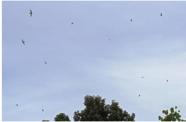
Glossy Swiftlets

Travelling around the Settlement, airport and town areas we encountered a few Red Junglefowl , Common Emerald Dove , Christmas Island Imperial Pigeon and of course thousands of Glossy Swiftlets .