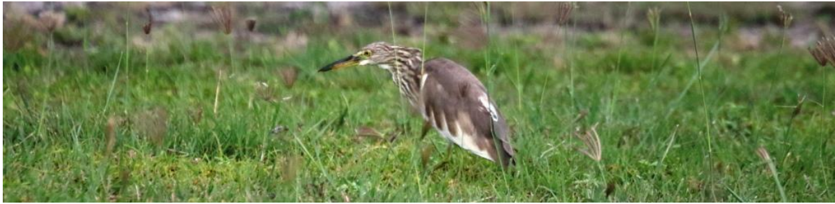
Non breeding pond heron ssp (R.Baxter)