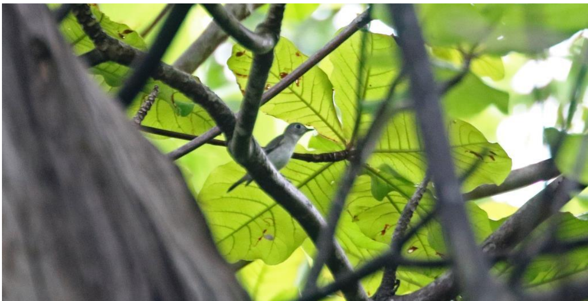
Asian Brown Flycatcher

That evening we enjoyed another nice dinner at the local restaurant whilst reminiscing over yet another great day's birding. The next morning after an early breakfast, excitement mounted as we headed off to search for the mystery flycatcher. We spread out and began the search. A rather worrisome thirty minutes passed and nothing yet, but we did enjoy close views of roosting White Tern and then it happened, movement in the canopy, then it flew out and landed on a branch for us all to see. Stellar perched views of ASIAN BROWN FLYCATCHER as it fluttered from branch to branch and even called a few times.