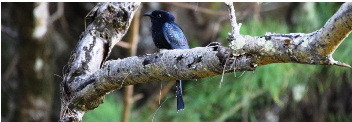
Square-tailed Drongo Cuckoo (D.Baxter)

Monday morning had finally arrived and on this morning our main target and quite possibly the top target for the whole tour was now within reach. Drongo Cuckoo was a new bird for everyone on the trip and was now only a short ferry ride away. We all ventured across the lagoon to Home Island and within thirty minutes all had seen this astounding rarity. It sat out in the open for some time while we admired it and enjoyed most memorable close-up encounters with the handsome rarity.....a magical sight! For the next few days we had the privilege of spending time with it on every visit to the island.