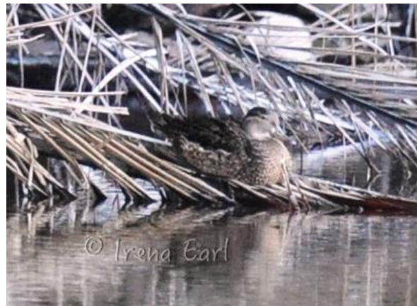
Eurasian Teal (Irena Earl)

The next two days our group split up with some people staying on Home Island while the majority of the group stayed on West Island. On West Island we visited many of the island's birding hot spots and gained increasingly better views and some nice photos of species we'd seen over the first three days.