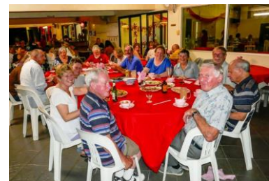
Group photos