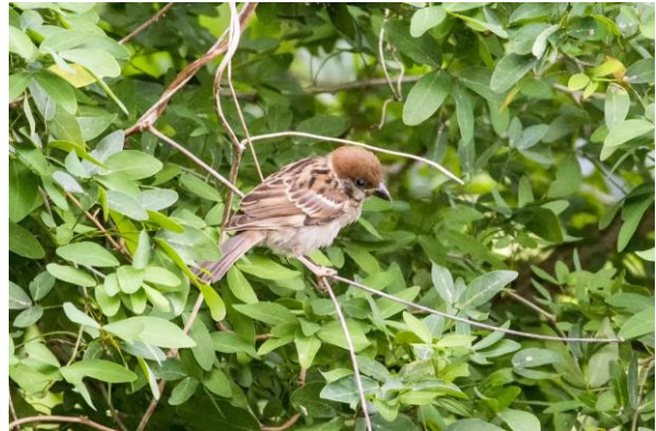
Java Sparrow and Tree Sparrow (John Donkin)

Several of us took a cruise along the island's protected northern coastline, snorkelling and photographing the local seabirds. As is always the case with these tours we have birders with varying levels of enthusiasm as well as non-birding partners. None of the activities are compulsory and often when we we're out birding, members of the group engage in activities such as sightseeing, swimming, golf, shopping or learning about the rich history and culture of the islands, as well as, of course, relaxing.