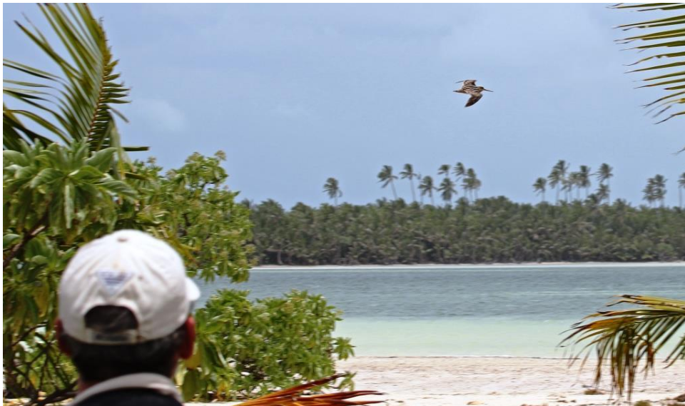
Pin-tailed Snipe (Richard Baxter)

The first spot we stopped we flushed two PIN-TAILED SNIPE which decamped into the lagoon-side undergrowth.