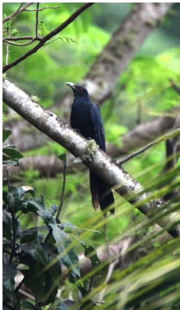
Asian Koel

ASIAN KOEL continued to be difficult but after a few failed attempts we eventually had cracking views of three males before breakfast on the second last morning.