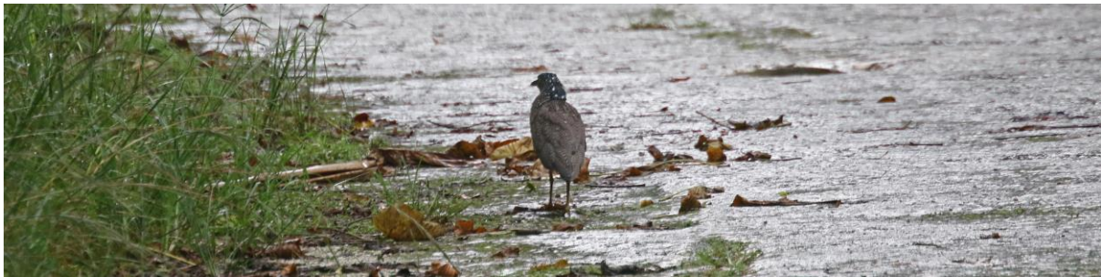
Malay Night Heron (Damian Baxter)

ASIAN KOEL continued to be difficult but after a few failed attempts we eventually had cracking views of three males before breakfast on the second last morning.