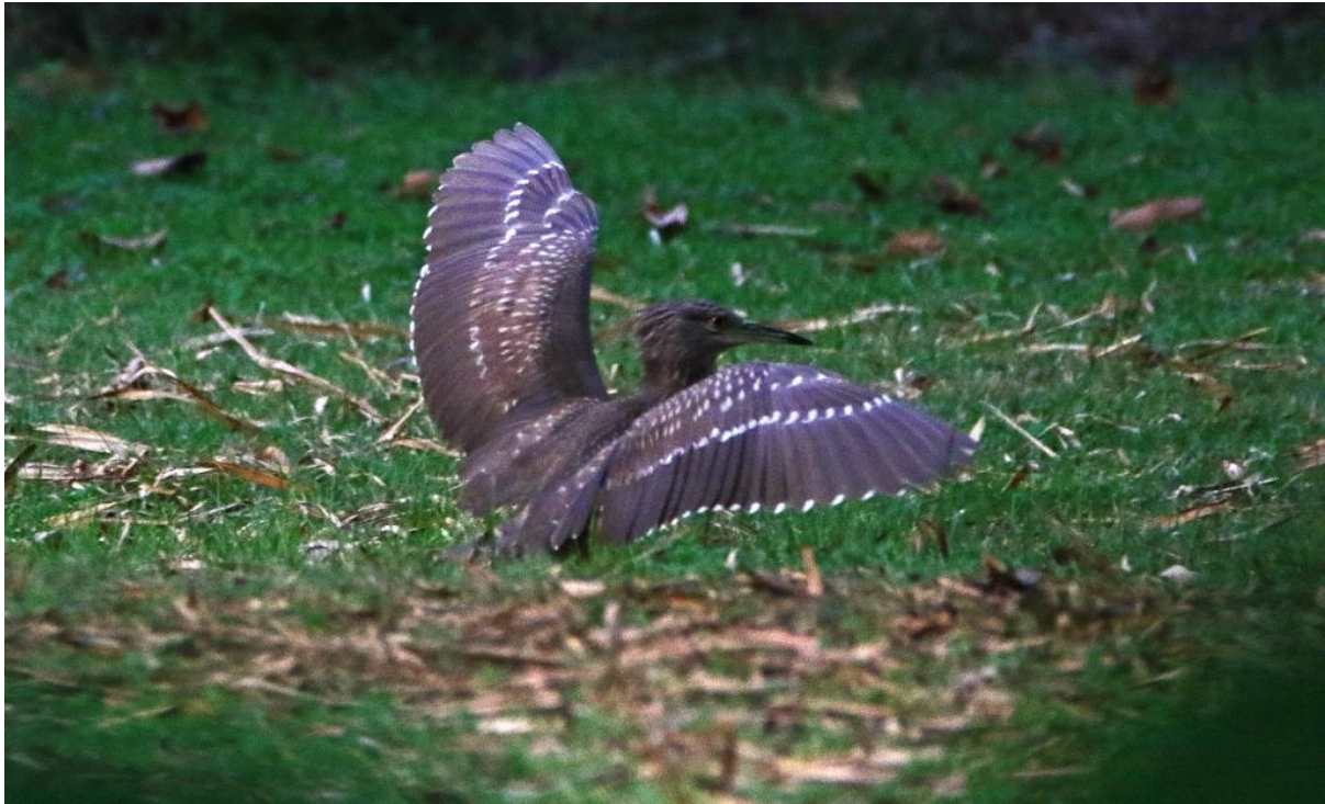
Black-crowned Night Heron (Damian Baxter)