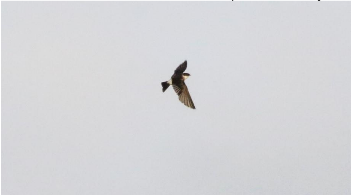
Asian House Martin

After about forty minutes of waiting a lone ASIAN HOUSE MARTIN cruised overhead and spent the rest of the afternoon in the vicinity. This was the first time we had recorded this species on the island since 2011. We were happy with our house martin sighting and it was forecast to continue to blow from the north for another few days. We would return again.