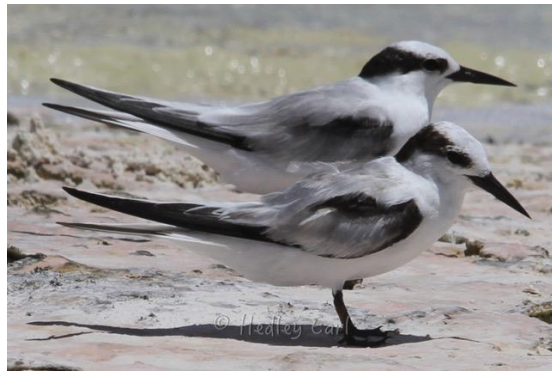
Saunders's Tern (Hedley Earl)