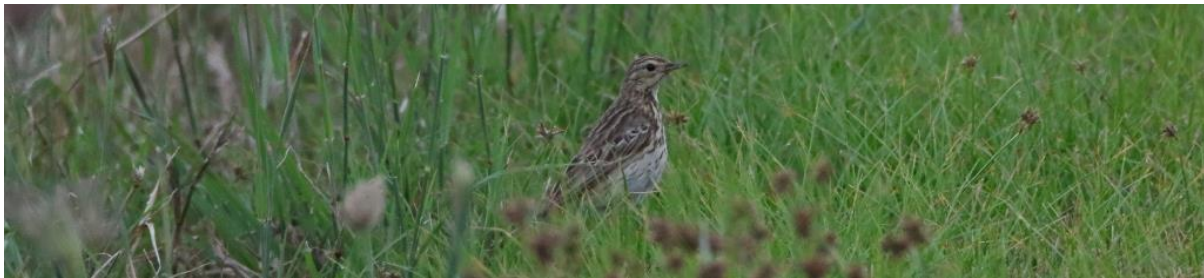
Tree Pipit (Richard Baxter)

Our list of vagrants included some real gems like Brown Shrike, Swinhoe's Snipe, Schrenck's Bittern, Red-billed Tropicbird, Yellow Bittern, Rosy Starling, Chinese Pond Heron, Eurasian Curlew, Common Kingfisher, Northern Pintail, Eurasian Teal, Pin-tailed Snipe and Grey Wagtail. All these, coupled with a great bunch of birders made for a wonderful time on the two islands.