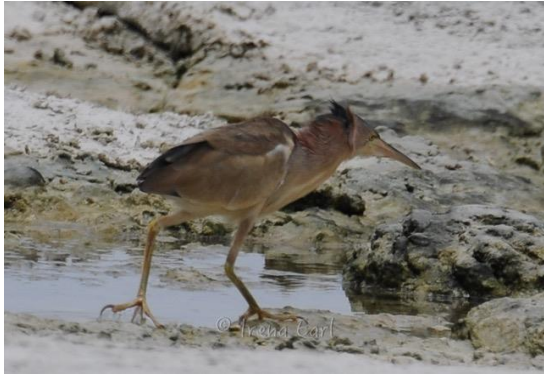
Yellow Bittern

Thanks must go to a wonderful group of enthusiastic participants, who worked as a team to find birds not only for themselves but the entire group. We will all hold many good memories from both these tours for a long time into the future.