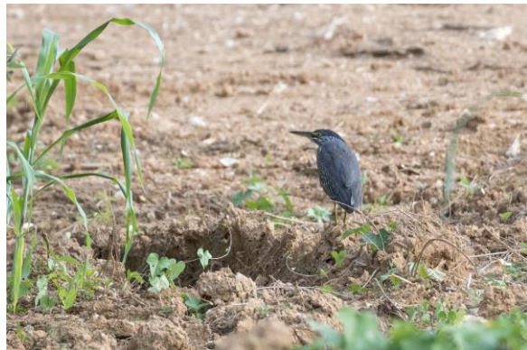
Striated Heron (Bob Harvey)

We arrived on Cocos late afternoon and took a short drive to the northern end of the island seeing Green Junglefowl and numerous White-breasted Waterhen , before returning for our first evening meal on Cocos.