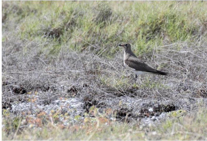
Oriental Pratincole ( Bob Harvey )

It had been an exceptional morning so far but there was still more to come. That afternoon we headed over to South Island where we had six SAUNDERS'S TERNS and a brief view of a EURASIAN CURLEW just before its sandbar was covered by the incoming tide and it flew. Tearing ourselves away from the terns we headed to a private beach around the corner where our hosts had prepared a delicious lunch for us with the obligatory champagne to celebrate our Saunders's Terns. Lunch was followed by a relaxing swim in warm shallow lagoon waters. What a great way to end a wonderful day in these postcard surroundings.