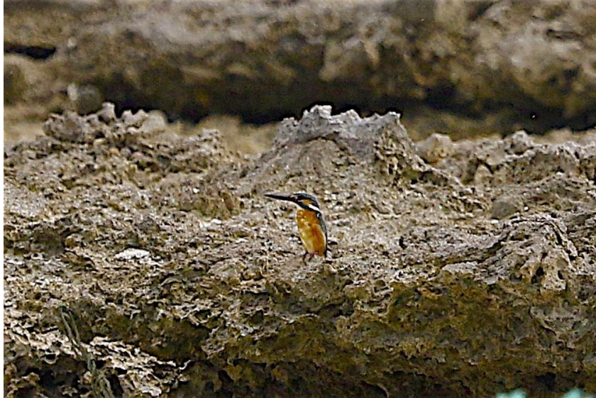
Common Kingfisher

The following day we caught the ferry to Home Island where we found 21 Barn Swallows near the garbage tip and the local endemic ssp of Buff-banded Rail which although quite skulking allowed some nice photos to be taken of what is a highly sought-after endemic sub species.