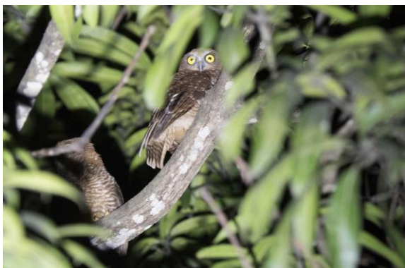
Christmas Boobook

Real features of these islands are the incredible landscapes and breathtaking natural beauty and when these are combined with some of Australia's most prized avian specialties, blend beautifully, creating unique photography moments. We always allow some flexibility to take advantage of these photographic opportunities we encounter while traversing the islands, allowing the group's photographers to get the best shot possible. During the week we revisited many sites when the light was good to photograph roosting seabirds and rainforest species as well as the all-important 'must have' flight shots of the golden morph White-tailed Tropicbird.