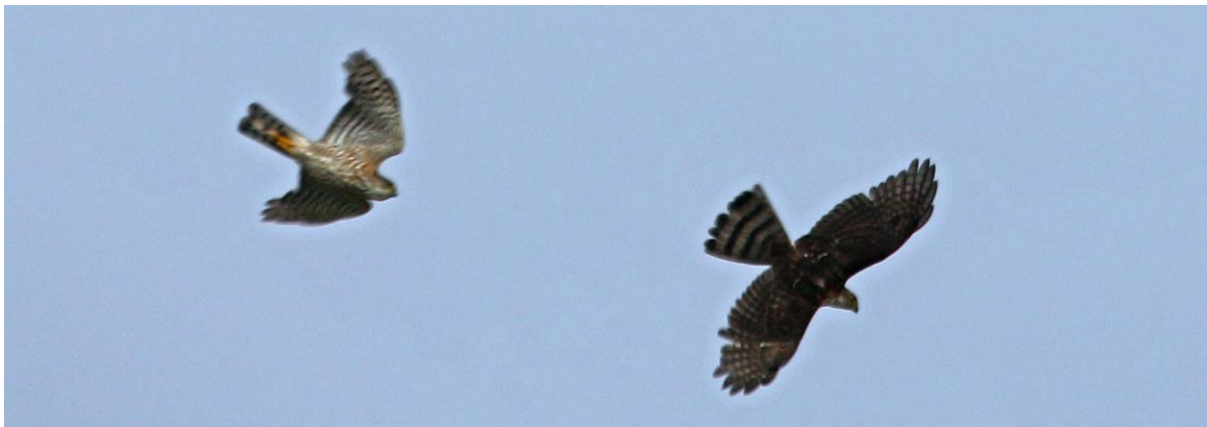
Japanese Sparrowhawk (Richard Baxter)

With the final mega rarity of the trip in the bag we only had one morning left on Christmas Island. We returned to the area of open grassland where we had previously found the Corncrake and this time we were rewarded with a nice surprise in the form of two JAPANESE SPARROWHAWK which circled overhead.