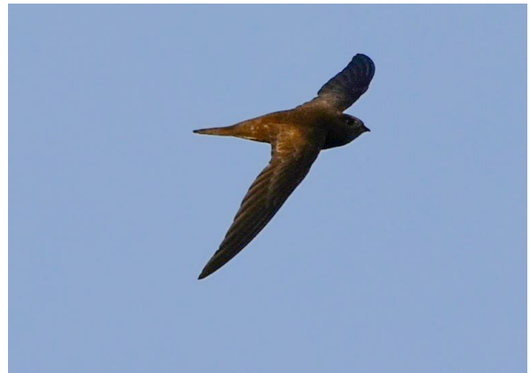
Common swift (Damian Baxter)

Over the next couple of days we ventured further into the local rainforest, which in my opinion, is close to the best Australia has. Several Common Emerald Dove and a few White-breasted Waterhen were seen during our drives, as were White-throated Needletails and Common Noddy .