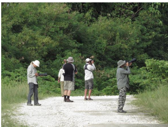
Photographing swifts (James Mustafa)