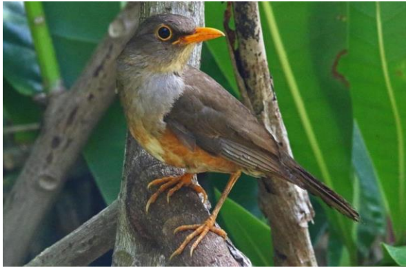
(Island Thrush) (R.Baxter)